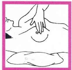
Fansoun om kokon