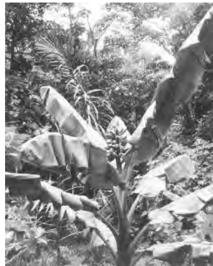
FIG. 1. Fe'i banana plant ( Karat ) with erect bunch.

Karat has been eaten in Micronesia for hundreds of years. A study of flora was carried out in Kosrae, one of the four Federated States of Micronesia, in the 1830s [155]. At that time four banana cultivars were documented: Usr Kulasr (Kosraean for Karat ), Usr Kolontol ( Uht en Yap in Pohnpei), and two non-Fe'i cultivars, Usr Wac and Usr Kuria . All four cultivars are carotenoid-rich (table 1). Informants emphasize that there was greater consumption of these in the past.