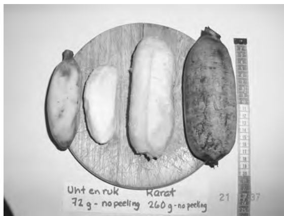
FIG. 2. Fe'i bananas ( Karat ), one unpeeled (far right) and one peeled (second from right), showing shape, size, and darker shades of skin and flesh compared to a common Micronesian banana, unpeeled (far left) and peeled (second from left).

Bananas are a crop that is easy to grow in a tropical climate. They do not require replanting or seed purchase, and they generally bear fruit throughout the year, providing ongoing availability, unlike some other crops [124]. Although there is no “perfect banana cultivar,” when pest and disease resistance, yield, taste, and nutri-